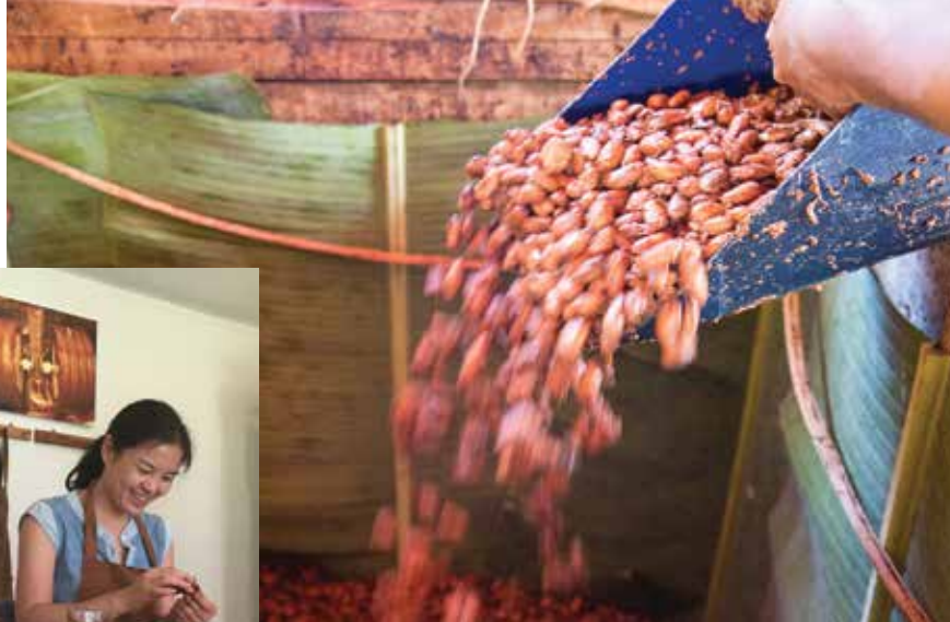
Left and bottom: Fresh cocoa is grown locally and used to make delicious dark chocolate at Uforia chocolate factory in the village of Jasri. Bottom left: 'Jari Menari' means 'flow of our fingers', and that's exactly what you get during one of their invigorating massages